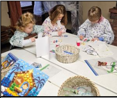
Sun-catcher painting of Nativity (back) Mosaic (foreground)