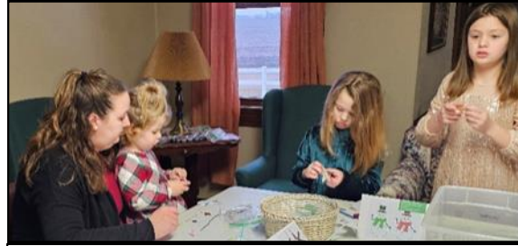
Rudolph bells and handprint angels