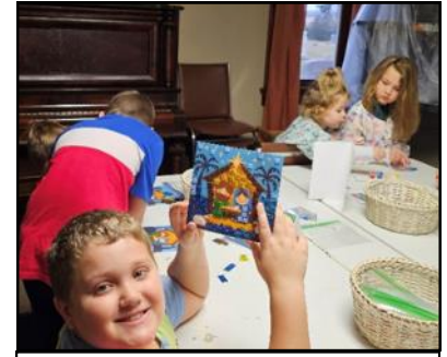
Glitter-tile mosaic pictures (foreground) and painting suncatcher in background